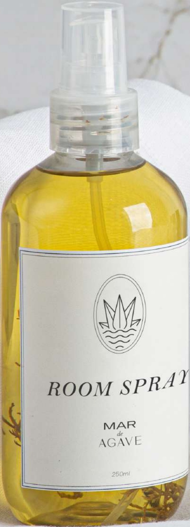
ROOM SPRAY 250ml